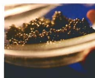
Clockwise from top: Cap Maison's Champagne zipline, Riofrío caviar, and chef Pierre Gagnaire's unique dish.