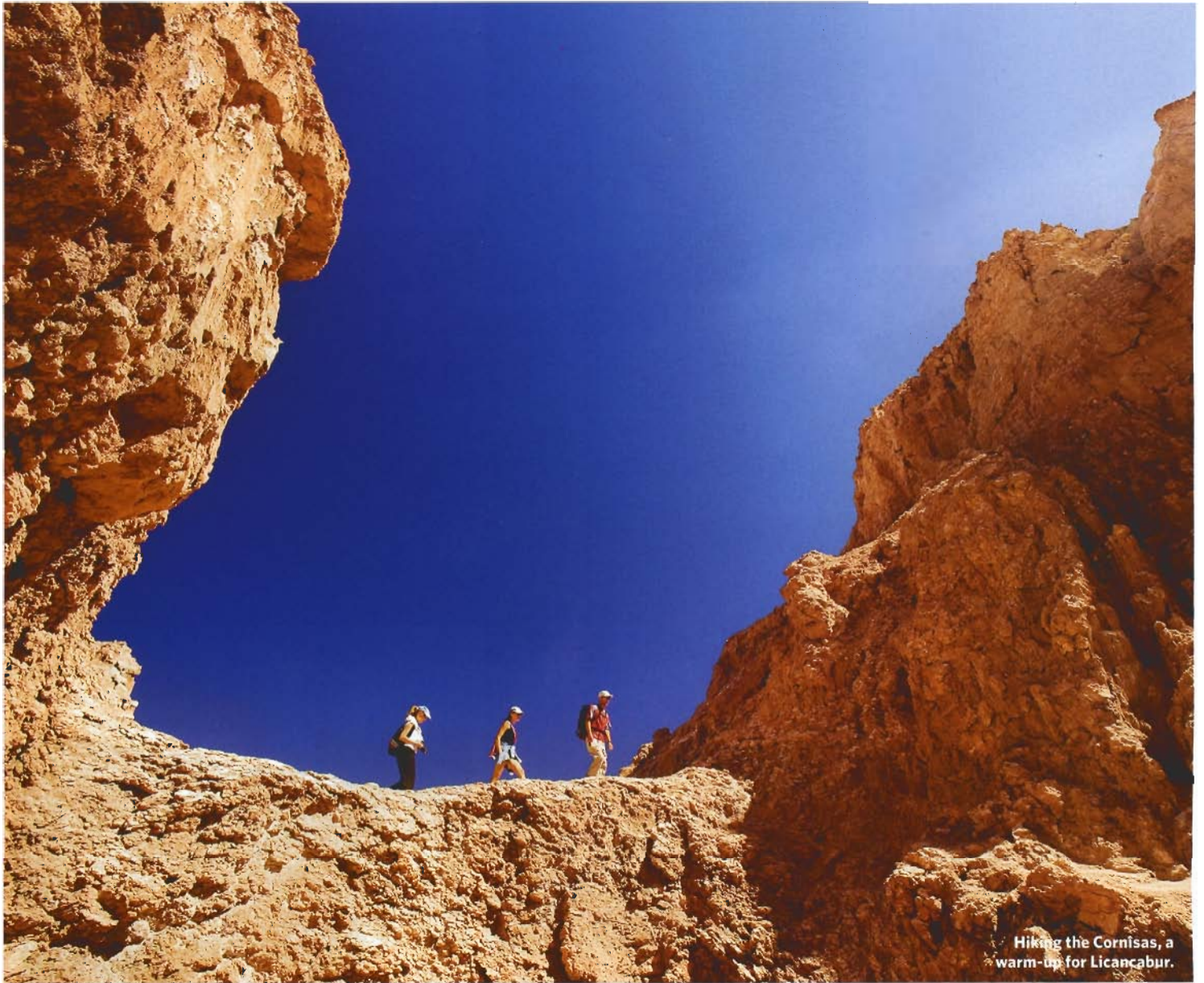
Hiking the Cornisas, a warm-up for Licancabur.

∴ DESTINATIONS, TRENDS, CULTURE, AND STYLE ∴